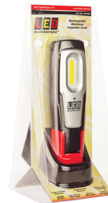
Part No. HH190-1 Single Blister