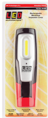
Part No. HH190 Single Blister