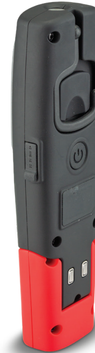
Charging Input 5 Volt/1Amp