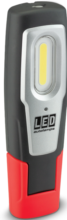
3.5 Hour Runtime Flood Lamp